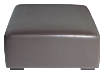
OT5 Cuba square