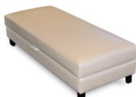
OT2 Oblong narrow*