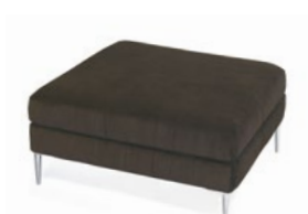
OT4 Square narrow*