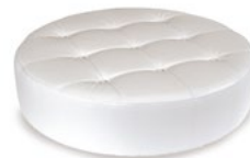
OT11 Enzo round - buttoned or plain