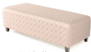
OT5 Cuba oblong