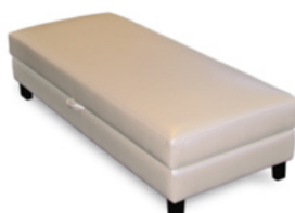
OT2 Oblong narrow*