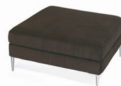
OT4 Square narrow*