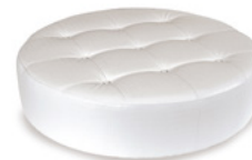
OT11 Enzo round - buttoned or plain