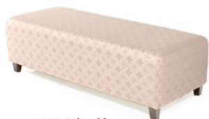
OT5 Cuba oblong