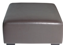
OT5 Cuba square